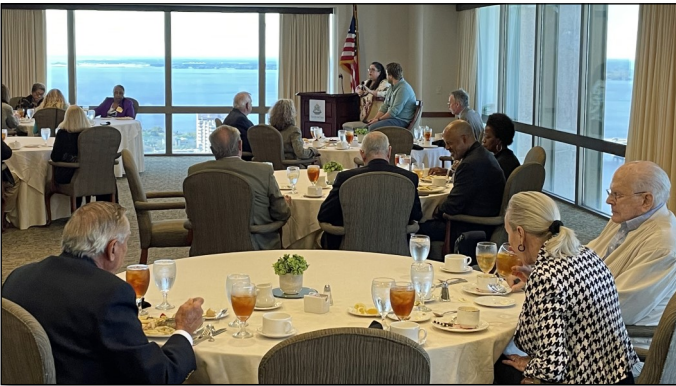
In-person Meetings Back at Tiger Bay After Covid-19 Shutdown